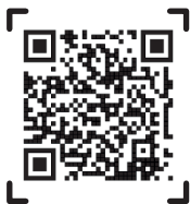
QR Code Scan